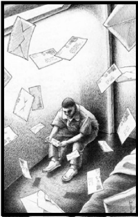
Artist: Matt Matteo

Frontiers of Justice, Vol. 3: The Crime Zone ©2000