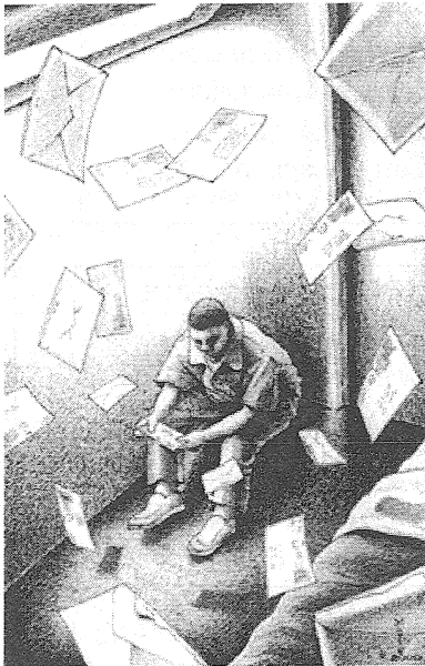
Frontiers of Justice, Vol. 3: The Crime Zone ©2000