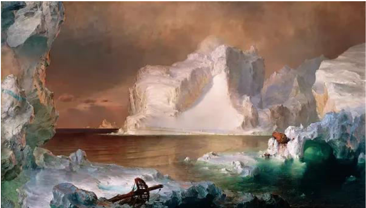
The Icebergs, by Frederick Church