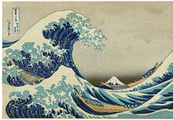
The Wave, by Katsushika Hokusai