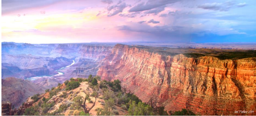
A section of the Grand Canyon

24. If you could only pick one person, who would you want to be your companion on this trip? (It could be someone in your family or someone fictional, famous, etc.)