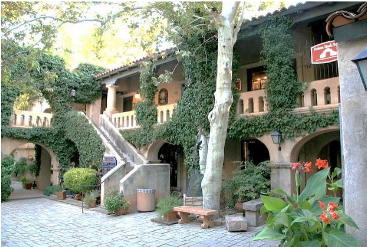
Tlaquepaque Arts & Crafts Village

20. As a business owner, what would you do to draw people to your store and keep them coming back? Write an ad for your store.