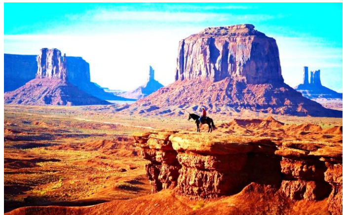
Monument Valley, site of filming for countless movie and TV show "westerns"