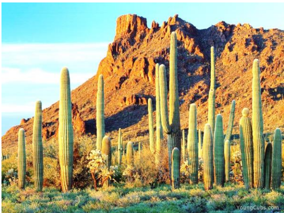
Saguaro (sa-wah-row) and organ pipe cactus